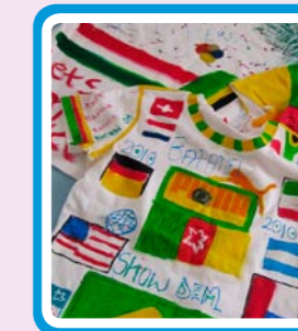
The winning t/shirts

World Cup fever has taken the country by storm and Sisters is not being left out!! On Friday 11 June, all our residents sported their hand painted, individually decorated t/shirts. A competition was held and