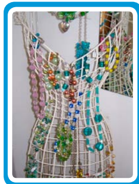
Some jewellery made by our residents