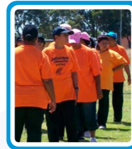
Some of the participants at the sports day

During the month of December, 16 Days of Activism Against Violence Against Women are set aside with many and various activities taking place, last year culminating in a thanksgiving service at Place