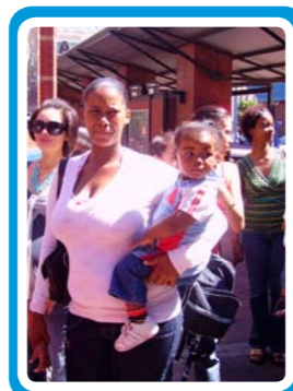
Some of our excited residents and children outside the Two Oceans Aquarium